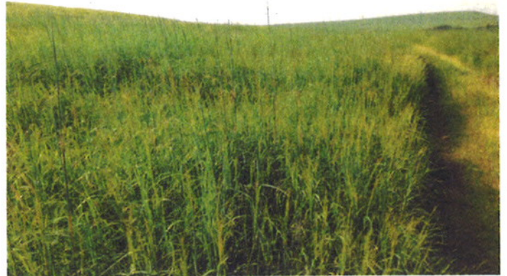
Good stand of tallgrass along Fox Creek Trail.

This is a northern extension from the Bottomland Trail, but is not wheelchair accessible. It winds along Fox Creek for six miles round-trip. This trail allows visitors to experience a riparian area, while seeing a range of wildlife such as turkey, white-tail deer, and a variety of bird species. You can access this trail from two trailheads, one at the visitor center and one from the Bottomland Trail. If you park at the visitor center, a trail leads a short distance south from the parking lot to a fence corner. From here you can see where the trail, the Z Bar Spur, travels