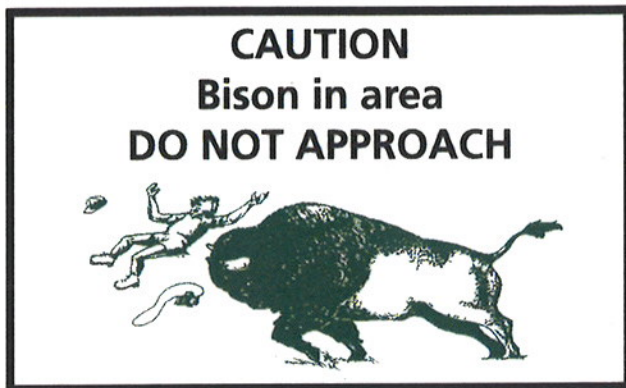
Pay attention to bison warning signs.

cattle guard as you enter Windmill Pasture. Please take note of various bison warning signs. Hikers are cautioned to keep at least 100 yards from the bison. For your safety, do not attempt to pet, harass, approach, or otherwise disturb the bison. Despite their docile appearance, they are very quick, agile, and unpredictable.