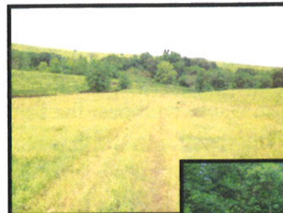
Approach and rough terrain along Palmer Creek Loop. NPS photos.

On the eastern side of the Prairie Fire Loop the 2.3 mile Palmer Creek Loop veers off to the northeast and crosses and re-crosses Palmer Creek. This loop extends into the far northeast corner of the preserve. If you follow the loop counter-clockwise, pay special attention at the first creek crossing, as this is a wooded area and the trail may be covered and difficult to follow. The trail will continue north through the woods for about 200 yards and then veer off to the west through the grass, running parallel to the creek for about 600 yards before turning southwest and recrossing the creek.