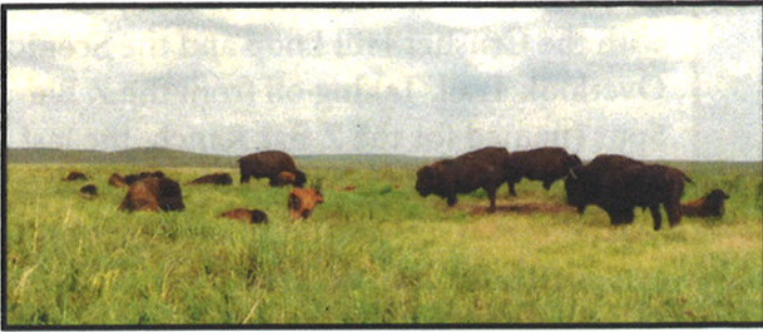
Bison lounging in Windmill Pasture.