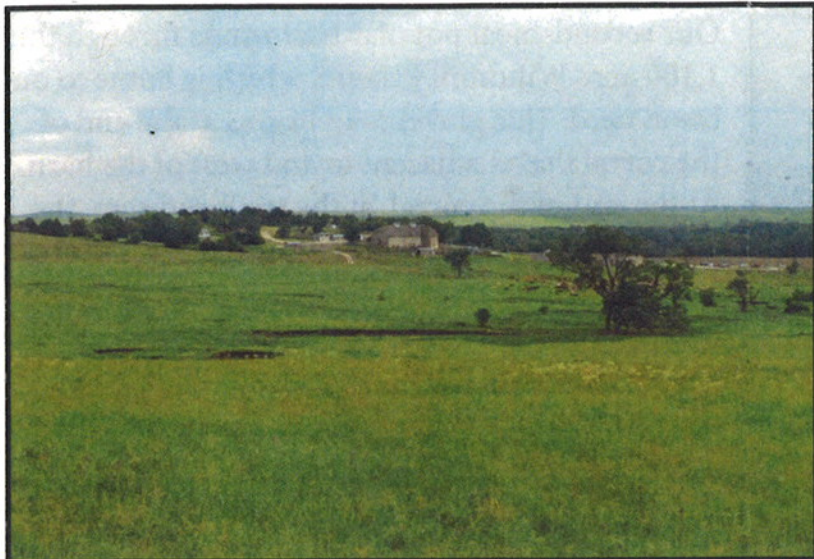
Ranch Complex from Ranch Legacy Trail.

This trail connects the Ranch Complex with the Crusher Hill Loop and the Scenic Overlook Trail. Taking off from the Z Bar Spur (named for the Z Bar Ranch, the last private ranch before becoming the current federal preserve), just south of the visitor center parking lot, it crosses a small creek, and then climbs the hill past the pit silo to the southwest. It then meanders by a cattle mineral site, which is crisscrossed with numerous cattle trails. Pay close attention to the main hiking trail and your map through this area.