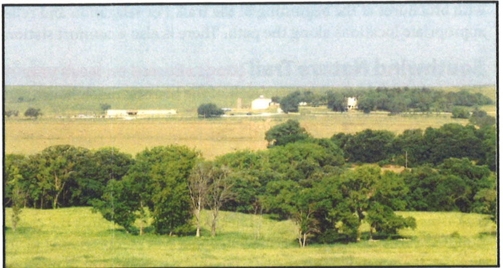
View of Ranch Complex looking west from Fox Creek Trail.

If starting from the Bottomland Trail, you will find the Fox Creek Trail heading north from the northwest section of the Bottomland Trail. It goes through an old cattle feedlot before heading downhill to a creek crossing, usually very shallow. Once out of the woods, the trail continues north for 2 ½ miles along the creek, ending in a loop over to the east side of the creek, opposite the Ranch Complex.