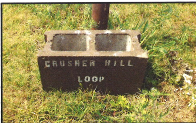
Cinder block trail marker.