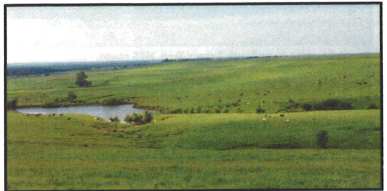
Large pond at start of Scenic Overlook Trail.

Our second-most popular trail winds through the 1,100 acre Windmill Pasture, which is home to our bison herd. This gravel road begins at the end of the corral that is adjacent to and west of the barn. At the end of the corral, at the trailhead sign, the gravel road turns left and crosses the first of three cattle guards on its 3.2 mile ascent to an excellent overlook. After the first cattle guard, the road curves around to the north and uphill past a pond on the left. Once at the top, you will find another