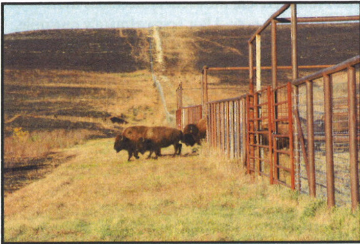
Bison being released from handling corrals.

A right turn from Schoolhouse Spur will lead you north on the Davis Trail past the bison handling corrals, constructed in 2013 for the purpose of