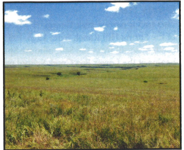
View from Prairie Fire Loop.

In the 1930's several dozen gas wells were installed throughout the northern portion of this pasture. Some of the old pipelines are now exposed. In 2009 these old wells were capped, just a small percentage of the thousands left in Kansas from those days.