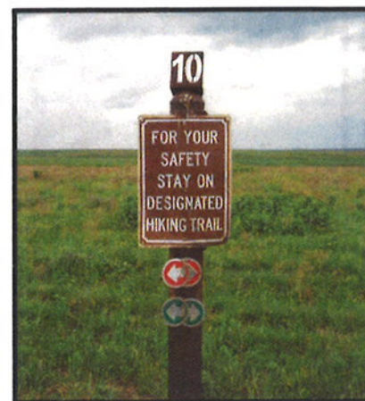
Old trail junction marker.

Be looking ahead for the old iron posts designating the trail junctions. Disregard the numbers and colored arrows attached to the posts. These are from an old trail system no longer in use. At the next junction the Crusher Hill Loop heads south. The Ranch Legacy Trail continues west and then turns north to connect with the Scenic Overlook Trail.