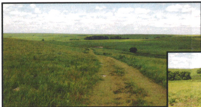
Views along Crusher Hill Loop.

This 2.2 mile loop departs to the south from the Ranch Legacy Trail and descends into a nice valley with a perennial stream and a cottonwood grove, providing plenty of cool shade in the summer and a nice place for a picnic or rest stop. Substantial rains may make the three stream crossings wide and potentially dangerous. Some of these crossings display excellent examples of the fragile layers of shale formations.