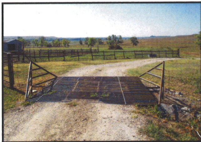
Cattleguard. Hiking gate to left.

From late March through April, controlled burns may be scheduled and some trails will be closed during burning operations. In addition, from April through July, you may encounter cattle in all pastures except Windmill. While these steers (no bulls) can be quite curious, they are not dangerous and pose no threat to hikers. Wherever you encounter a cattle guard, look for a gate off to the side for you to use. Please ensure that gates are closed behind you. Trail junctions are marked with a brown-painted cinder block on the ground with the trail names painted on it.