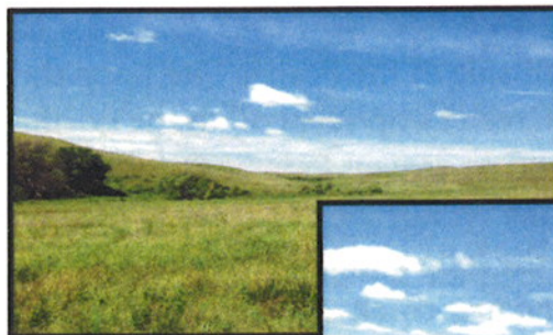
Views along Gas House Cutoff.