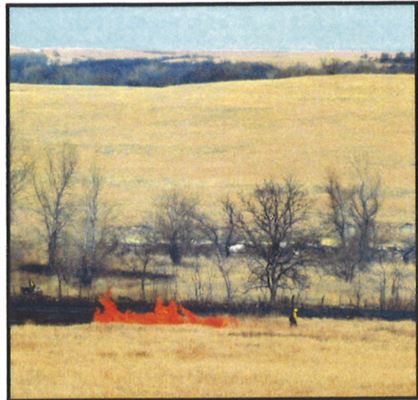
Controlled burn in progress.

Still, because cinder blocks get broken or moved, it is highly recommended that you carry the preserve's trail map with you, and remain cognizant of your location as you travel through the preserve. Cell phone coverage is not reliable in most parts of the preserve. Trail maps may be obtained at the visitor center and may also be downloaded from our website.