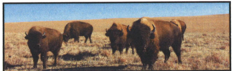
Bison on alert and wary.