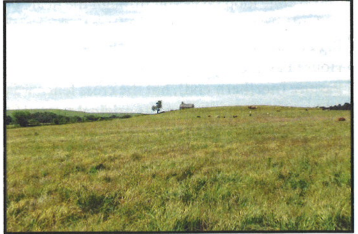
View of Lower Fox Creek Schoolhouse from Schoolhouse Spur.

If you continue on the Davis Trail past the Prairie Fire Loop junction, you'll come to the Gas House Cutoff trail heading to the northwest. This 1.3 mile trail bisects the Prairie Fire Loop in a gradual ascent. For most of this trail, you'll get incredible views of nothing but prairie. Except for the trail and occasional exposed natural gas lines, you'll find nothing to remind you of any human impact on the landscape.